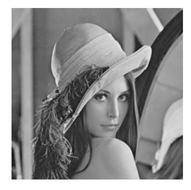
Figure 3: Steganos Stego-Image