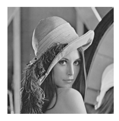
Figure 2: Cover Image

Steganos was able to recover the message when the stego-image was made available for decoding. However to evaluate the fragile nature of the embedding, Gaussian additive noise (with zero-mean and unit variance) was added to each pixel intensity value in the stego-image to produce the altered stego-image shown on Figure 5. Steganos was not able to extract the message. The software erroneously believed that the modified stego-image contained some encrypted data and asked for a decryption key.